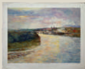
38. June Sunset over the Potomac Paper size 22.5" x 28.5. Image size 17.5" x 23.5". Limited edition print. Offset lithograph. Signed in pencil.