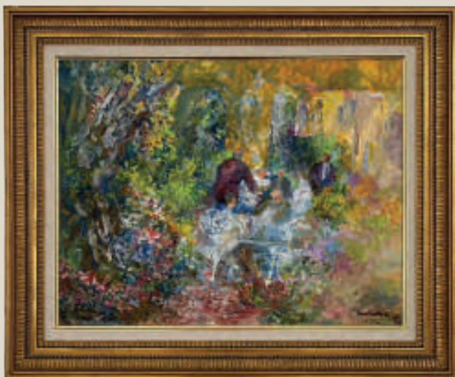
26. Doing Lunch SS 22" x 17", FS 23" x 28", Oil on canvas