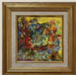
35. Abstract floral (square) SS 8" x 8", FS 13" x 13" Oil on canvas