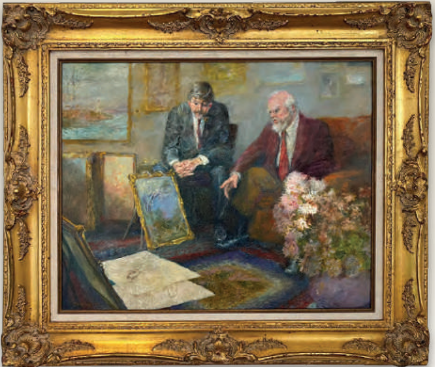
10. The Art Collector SS 23" x 29", FS 34" x 40" Oil on canvas