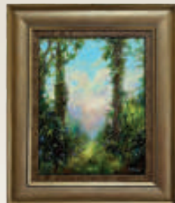
45. Between the Trees, oil on canvas