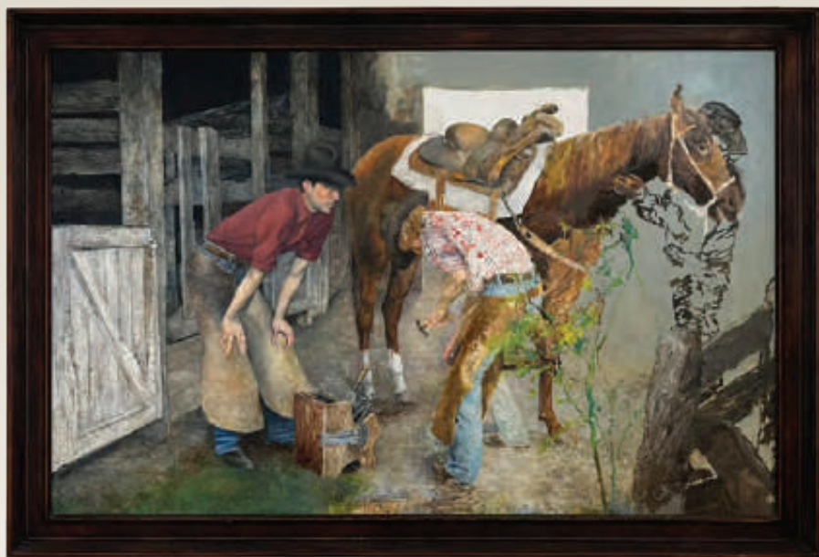
37. Autobiography of an artist SS 33.5" x 45.5", FS 36" x 48" Oil on canvas, unsigned