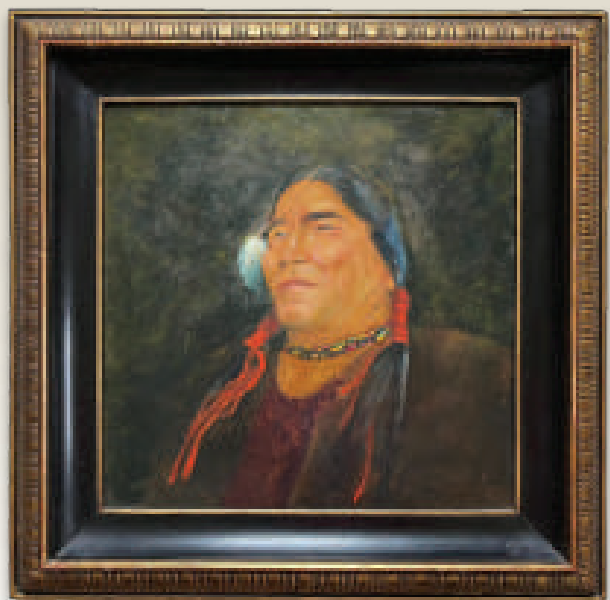
5. Portrait of Wichita Chief SS 18" x 18.5", FS 26.25" x 26.5" Oil on board, signed lower right