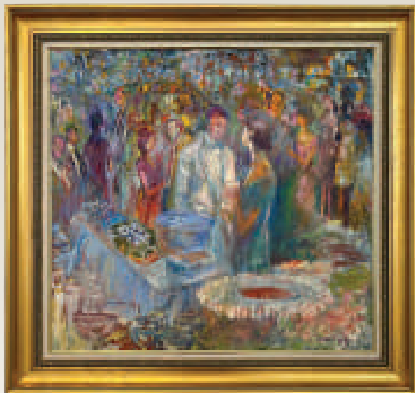
27. The Reception SS 27.5" x 29.5", FS 35" x 37", Oil on canvas