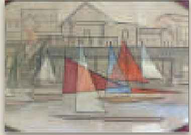
9. Geometric sail boat SS 7" x 10.5", 10.5" x 14" Watercolor on paper