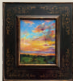
43. As the Sun Settles In, oil on canvas