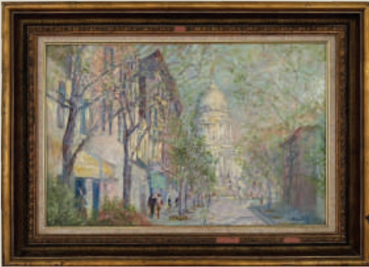
14. View of the Capital from New Jersey Ave SS 16.5" x 26", FS 24" x 34", Oil on board