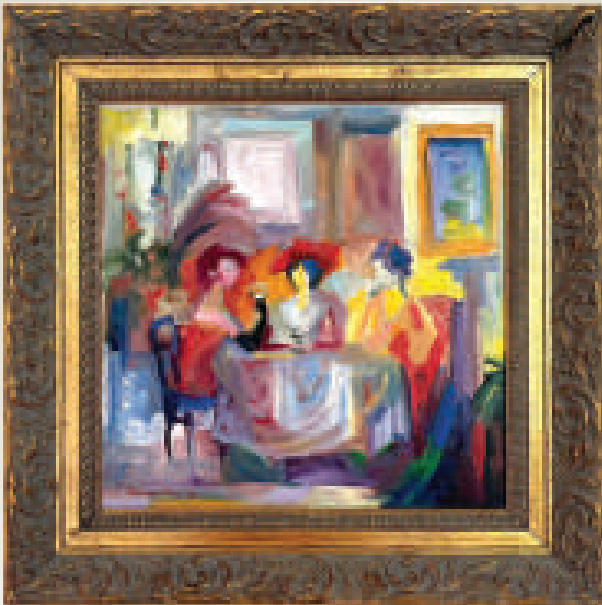
25. Champaign Ladies 18" x 18", Oil on canvas