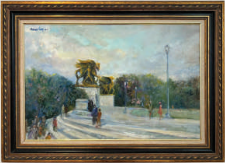
22. Arlington Memorial Bridge Steps SS 19" x 30", FS 27" x 37", Oil on canvas