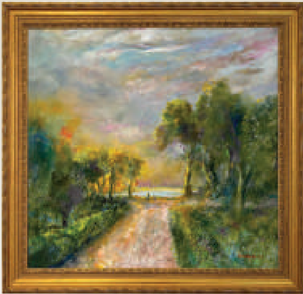
15. Road to the Lake SS 29" x 30", FS 35.5" x 37", Oil on canvas