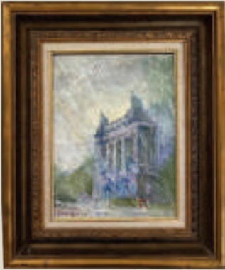
11. Carnegie - Mellon in the Rain SS 13" x 9.5", FS 21" x 17.25 Oil on board