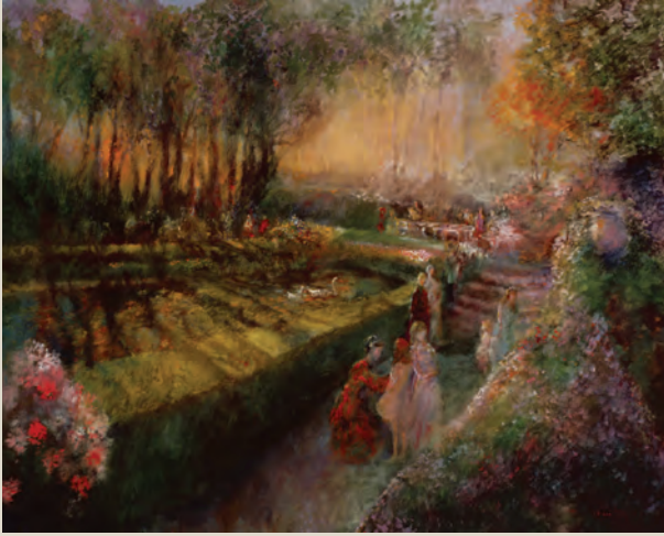
28. The Artist's Secret Garden 48" x 72", Oil on canvas