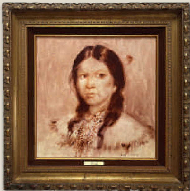
4. Indian Girl (Anadarko Maiden) SS 14.75" x 14.25", FS 21.75" x 21.25" Oil on board, signed lower right