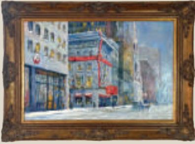
8. Cartier in Winter SS 23" x 35", FS 32" x 44" Oil on canvas