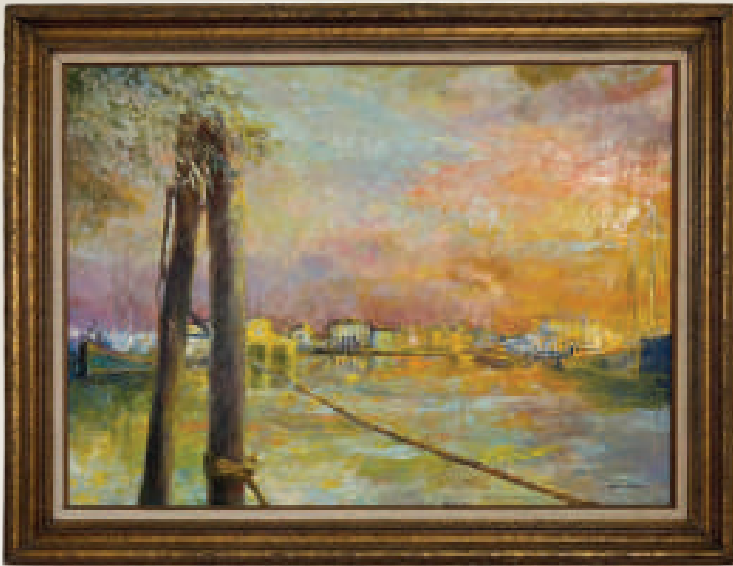
19. Florida Fishing Docks SS 29" x 39", FS 38" x 48", Oil on canvas