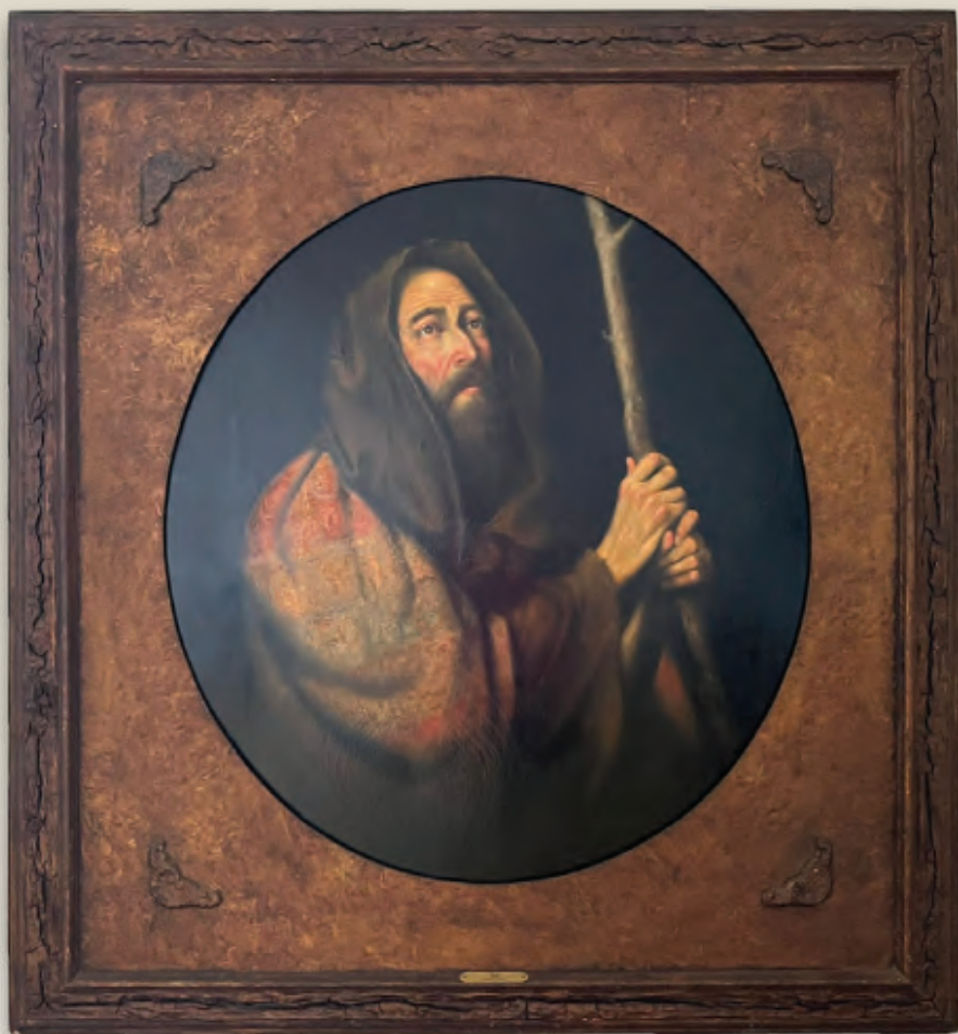
7. Portrait of Job SS 37" x 32.5", FS 53" x 50", Oil on canvas