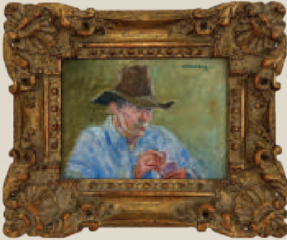
24. The Card Player 5.5" 7.5", FS 10" x 12", Oil on board