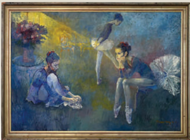
21. Preparing for the Ballet SS 39.5" x 56", FS 46" x 62, Oil on canvas