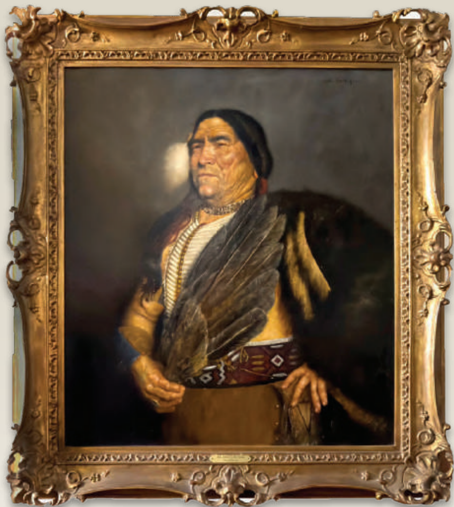
3. American King SS 33" x 28", FS 41" x 37", Oil on canvas