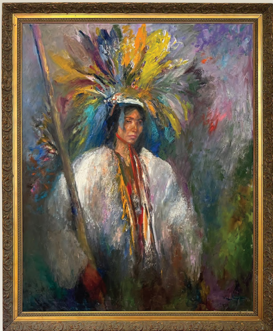
16. Wichita Prince SS 49" x 39.5", FS 56" x 46" Oil on board