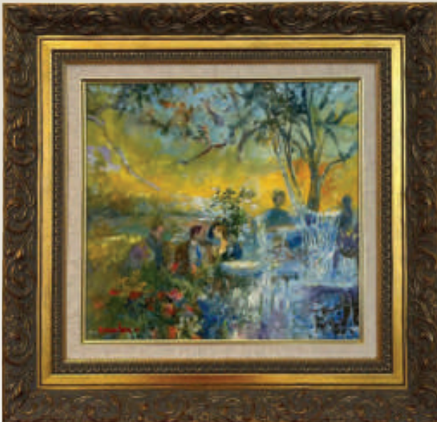
31. Yellow Magic SS 13.5 x 14.5", FS 23" x 22", Oil on canvas