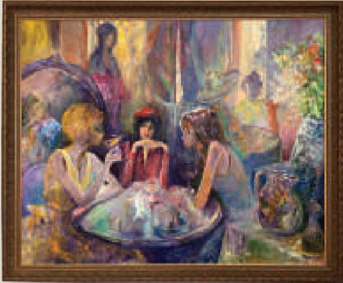
17. Luncheon at Patricia Murphy's SS 39" x 47", FS 46" x 53.5", Oil on canvas