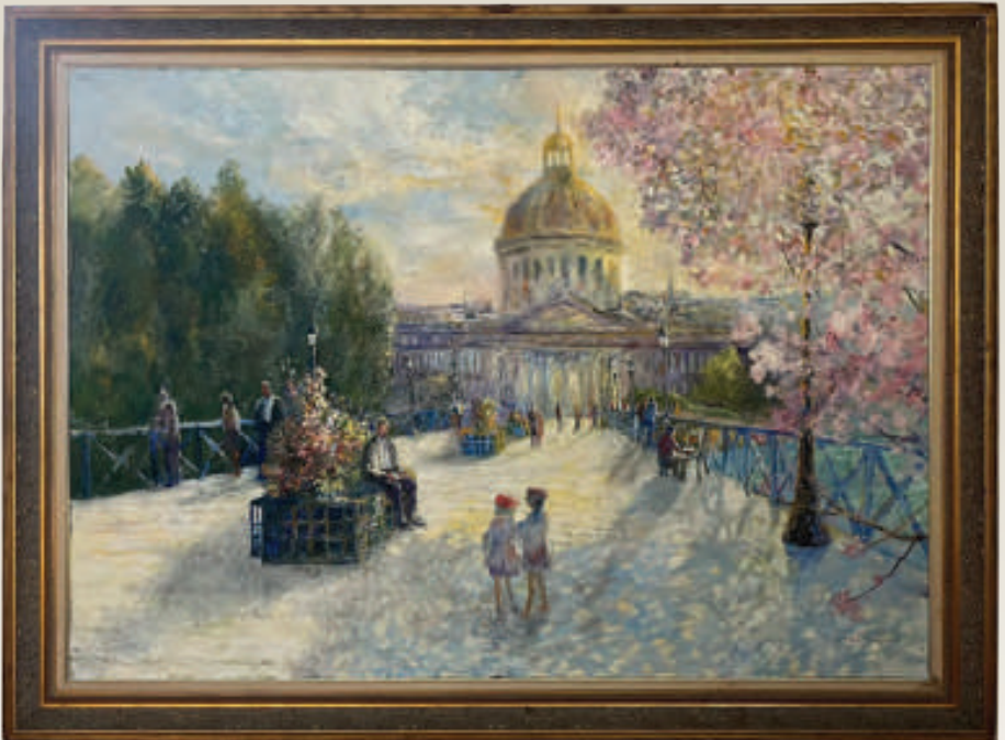
13. Rue De Pontenelle, Paris SS 49" x 69", FS 58" x 77", Oil on canvas