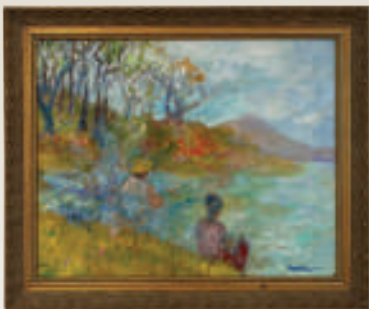
33. Riverside SS15.5" x 19.5", FS 19.5" x 23.5" Oil on canvas