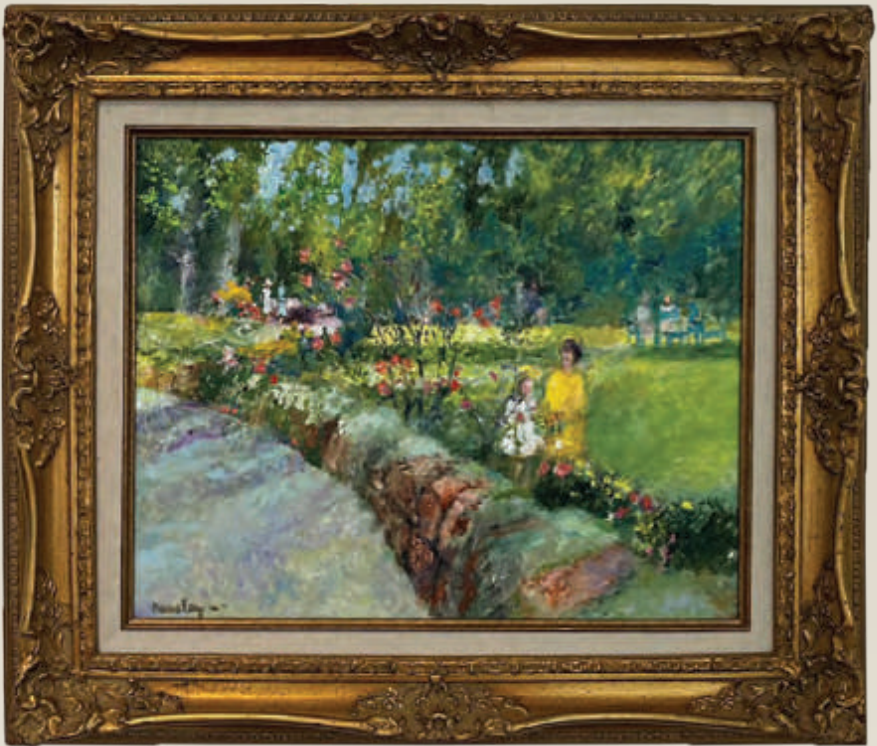
32. The Wall SS5" x 19", FS 23" x 27", Oil on canvas