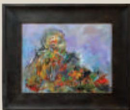
36. La Guitarista SS 10.5" x 13.5", FS 16" x 19" Oil on board