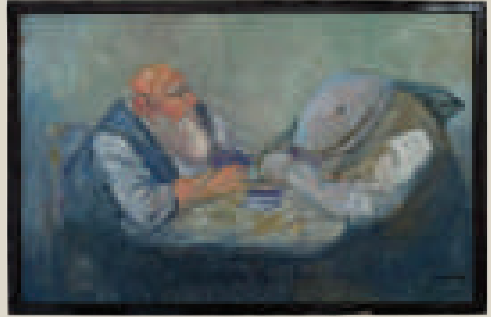
12. Card Shark SS 19" x 30", FS 20.5" x 31.5 Oil on board