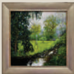
42. One Spring Morning, oil on canvas