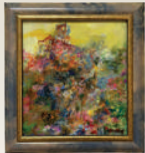
34. Abstract flowers SS 10.5" x 9.5", FS 14" x 13" Oil on canvas