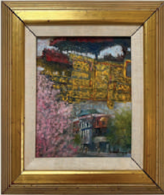
30. China Town SS 7.5" x 9.5", FS 15.5 x 13.5, Oil on canvas