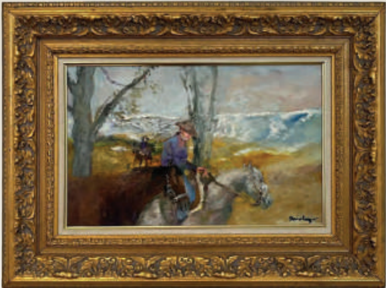
23. On the Trail SS 12" x 19", FS 21" x 28", Oil on canvas, signed lower right