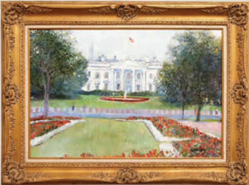
29. The White House SS 23" x 35.5", FS 34" x 46", Oil on canvas