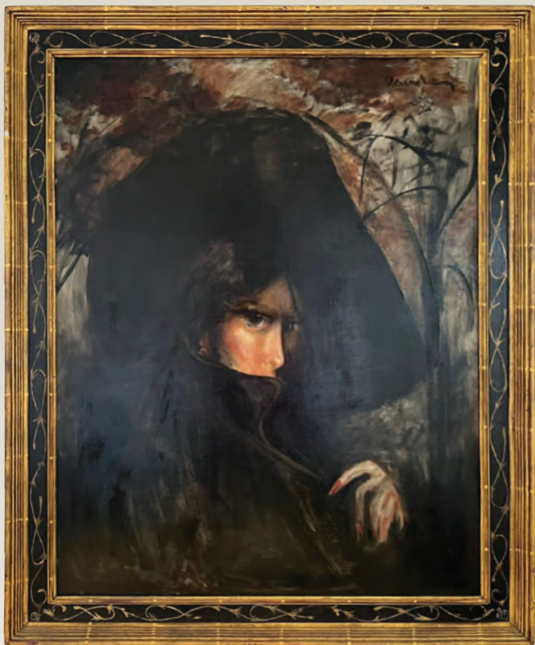
6. Lady in Black SS 31" x 23.5", FS 36" x 29", Oil on board, signed upper left