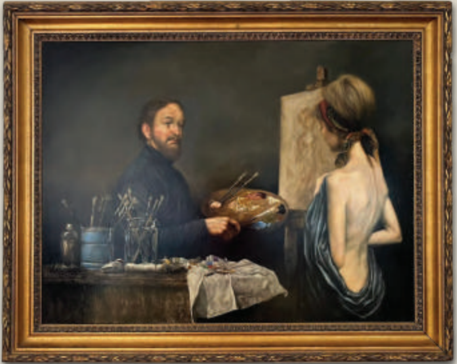
1. Artist and Model, SS 33" x 42" FS 40" x 50", Oil on board