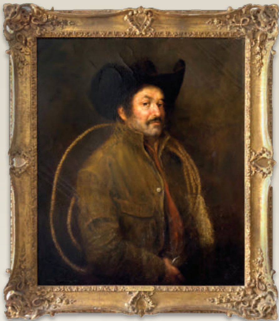
2. Cowboy Cavalier SS 30.5" x 35", FS 36" x 32", Oil on canvas