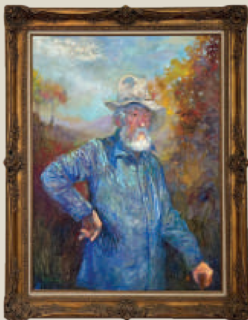
20. Walt Whitman SS 39" x 29.5", FS 48" x 38" Oil on canvas